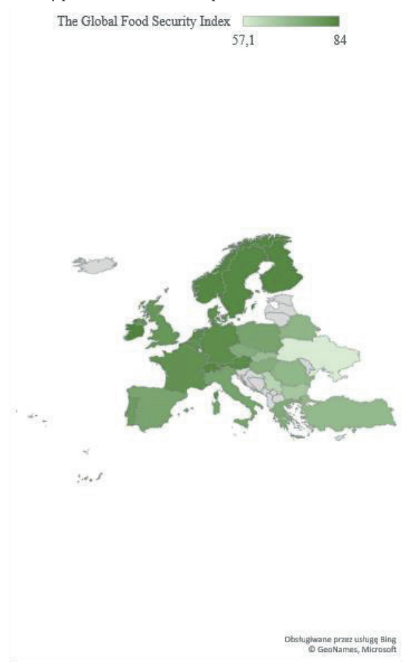
Chart 2. Food security performance of the European countries in 2019