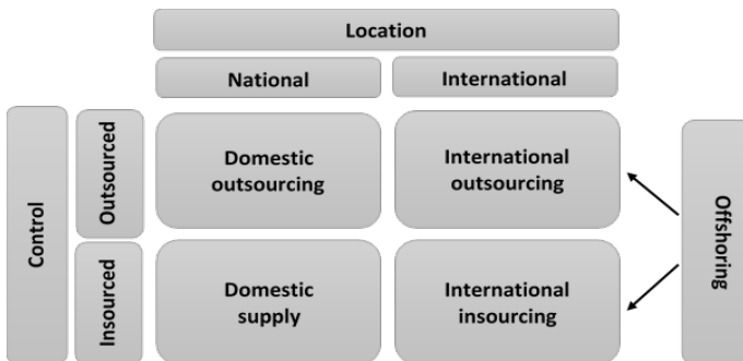
Figure 1. Division of outsourcing by location of services

Outsourcing and offshoring strategy is one of the most widespread development strategies among Western companies, and it consists, among other things, on the location of enterprises in other countries. It allows economic entities to maintain and strengthen their competitive advantage. In the literature on the subject one can find the division of outsourcing presented in Figure 1.